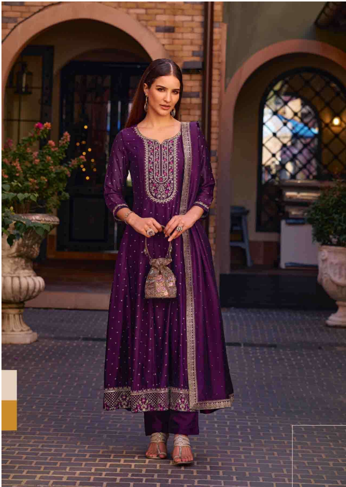
minimal and delicate work detail lends you an elegant and urbane look to astonish occasion.