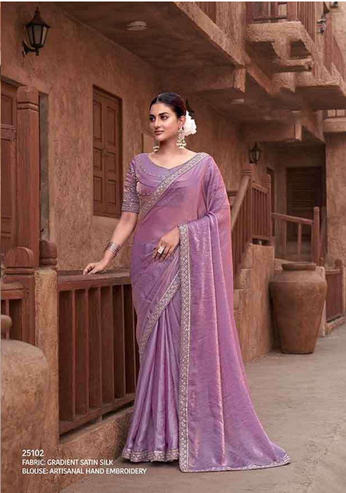
25102 FABRIC: GRADIENT SATIN SILK BLOUSE: ARTISANAL HAND EMBROIDERY