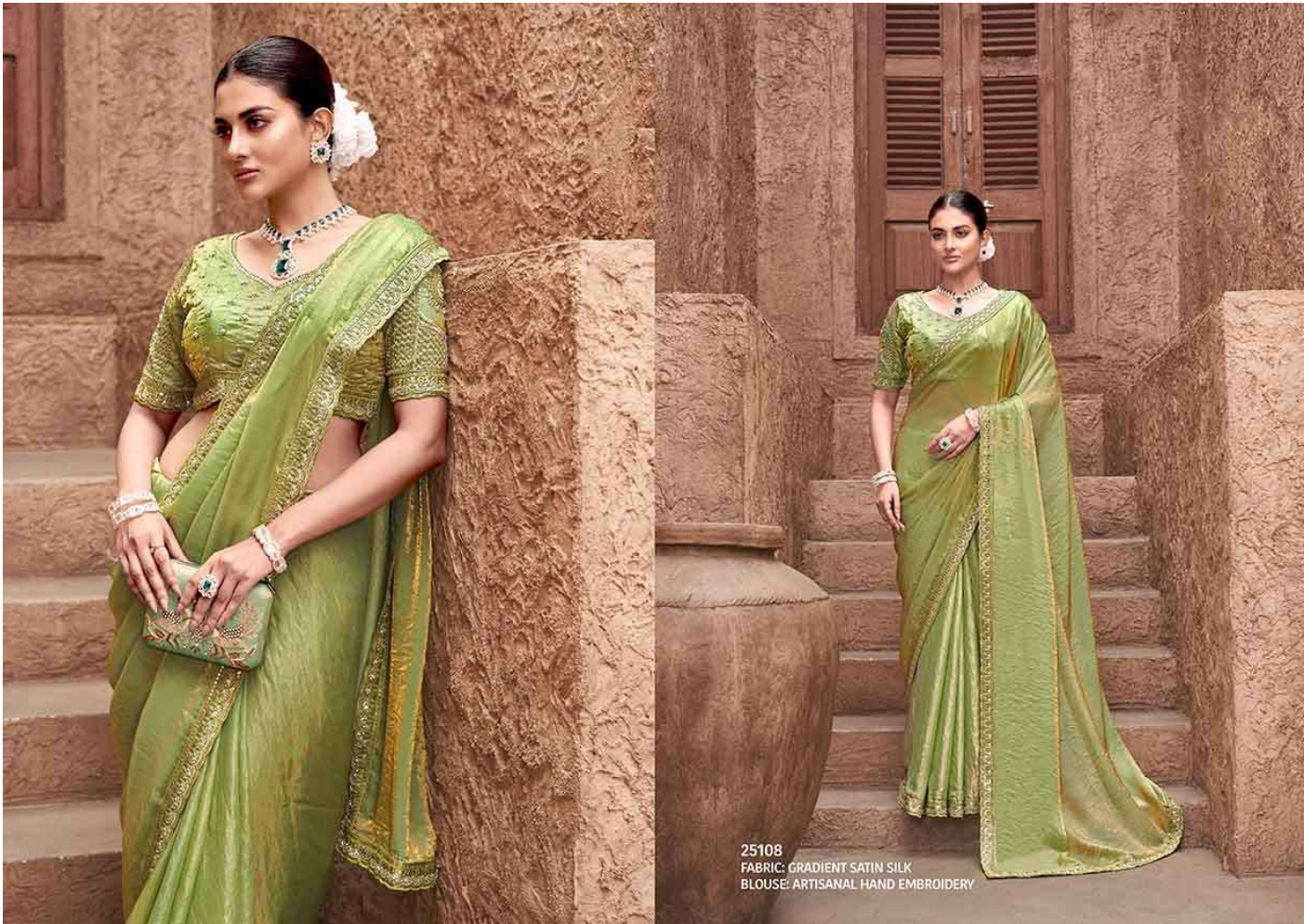
25108 FABRIC: GRADIENT SATIN SILK BLOUSE: ARTISANAL HAND EMBROIDERY