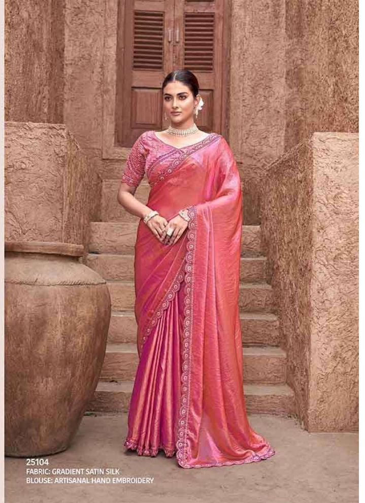
25104 FABRIC: GRADIENT SATIN SILK BLOUSE: ARTISANAL HAND EMBROIDERY