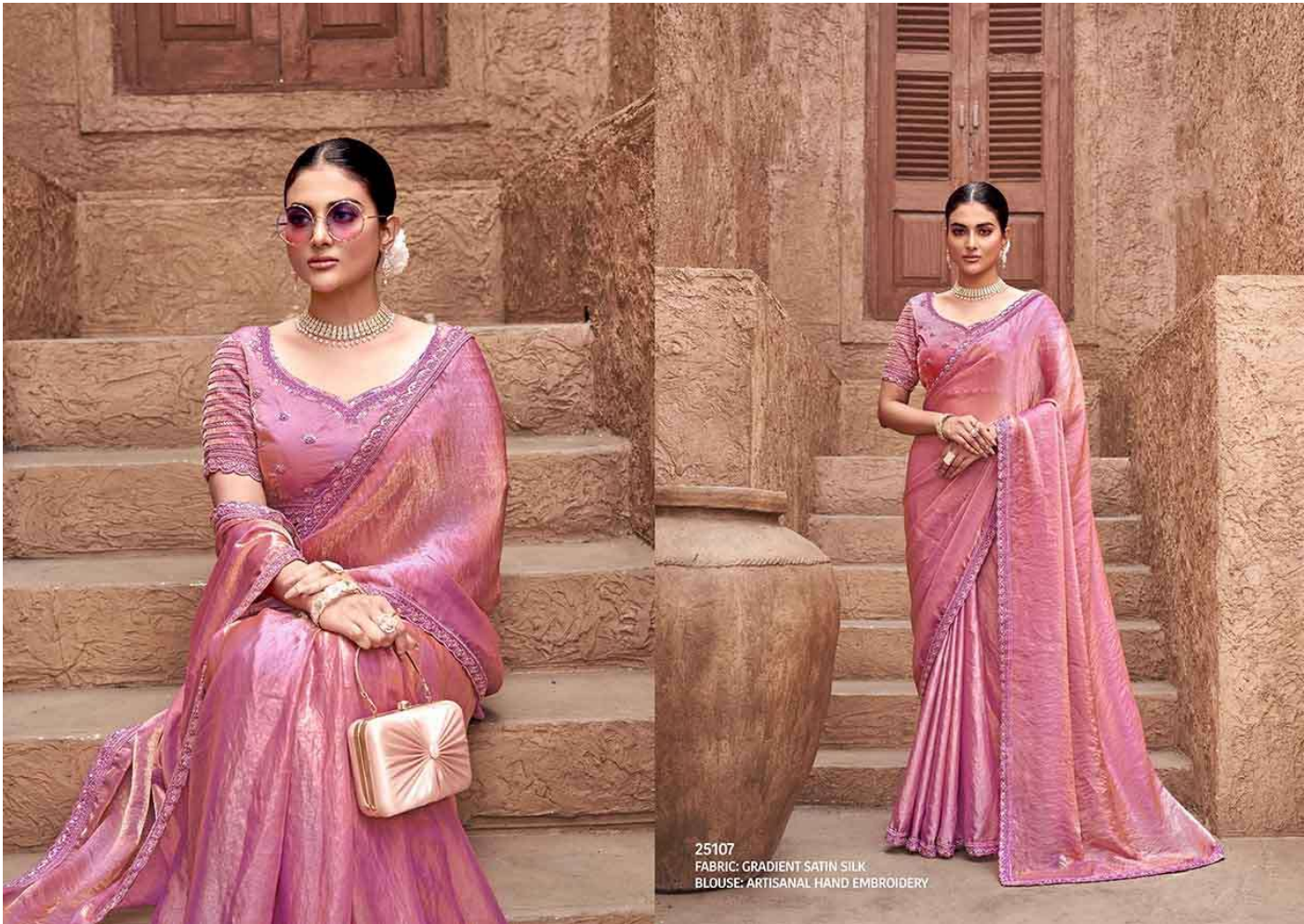
25107 FABRIC: GRADIENT SATIN SILK BLOUSE: ARTISANAL HAND EMBROIDERY