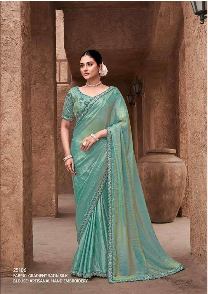
25106 FABRIC: GRADIENT SATIN SILK BLOUSE: ARTISANAL HAND EMBROIDERY