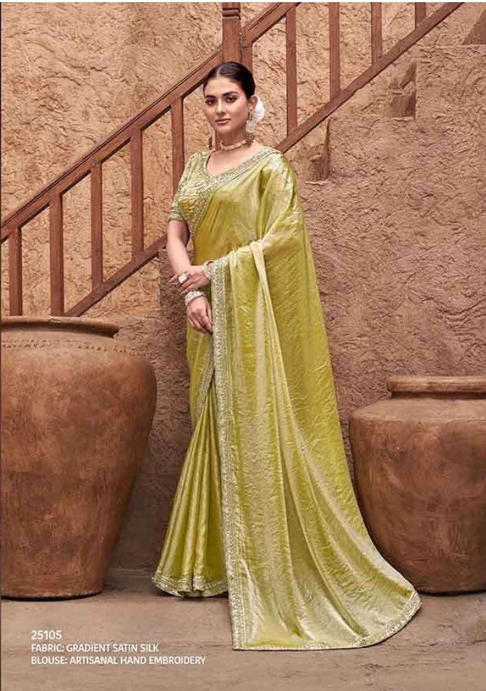
25105 FABRIC: GRADIENT SATIN SILK BLOUSE: ARTISANAL HAND EMBROIDERY