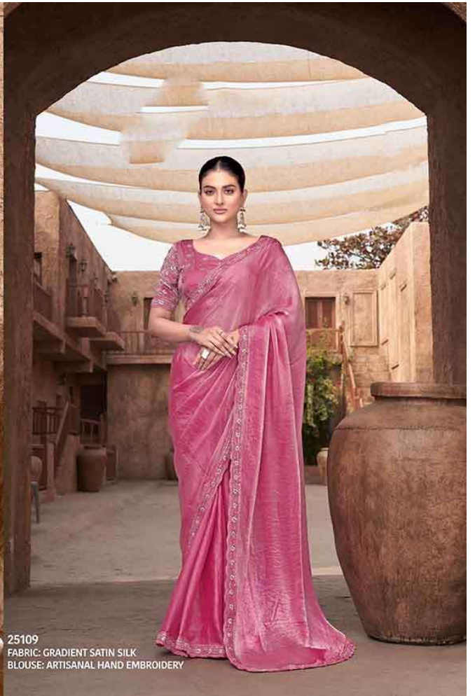
25109 FABRIC: GRADIENT SATIN SILK BLOUSE: ARTISANAL HAND EMBROIDERY