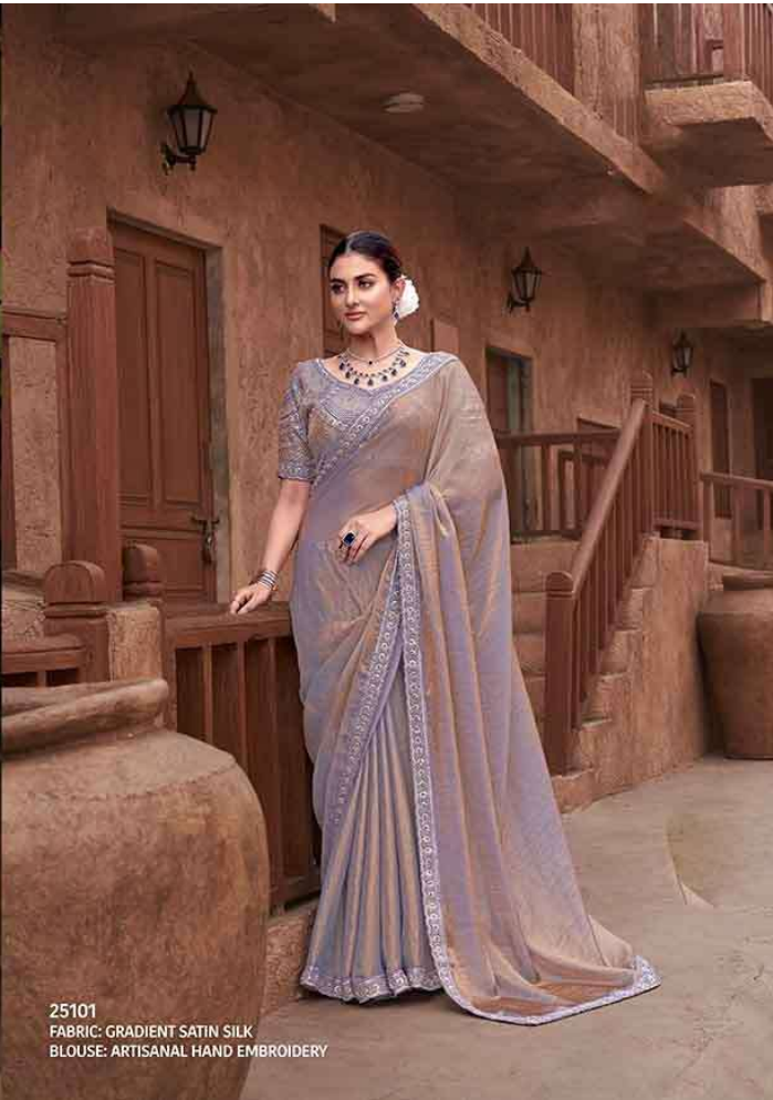
25101 FABRIC: GRADIENT SATIN SILK BLOUSE: ARTISANAL HAND EMBROIDERY