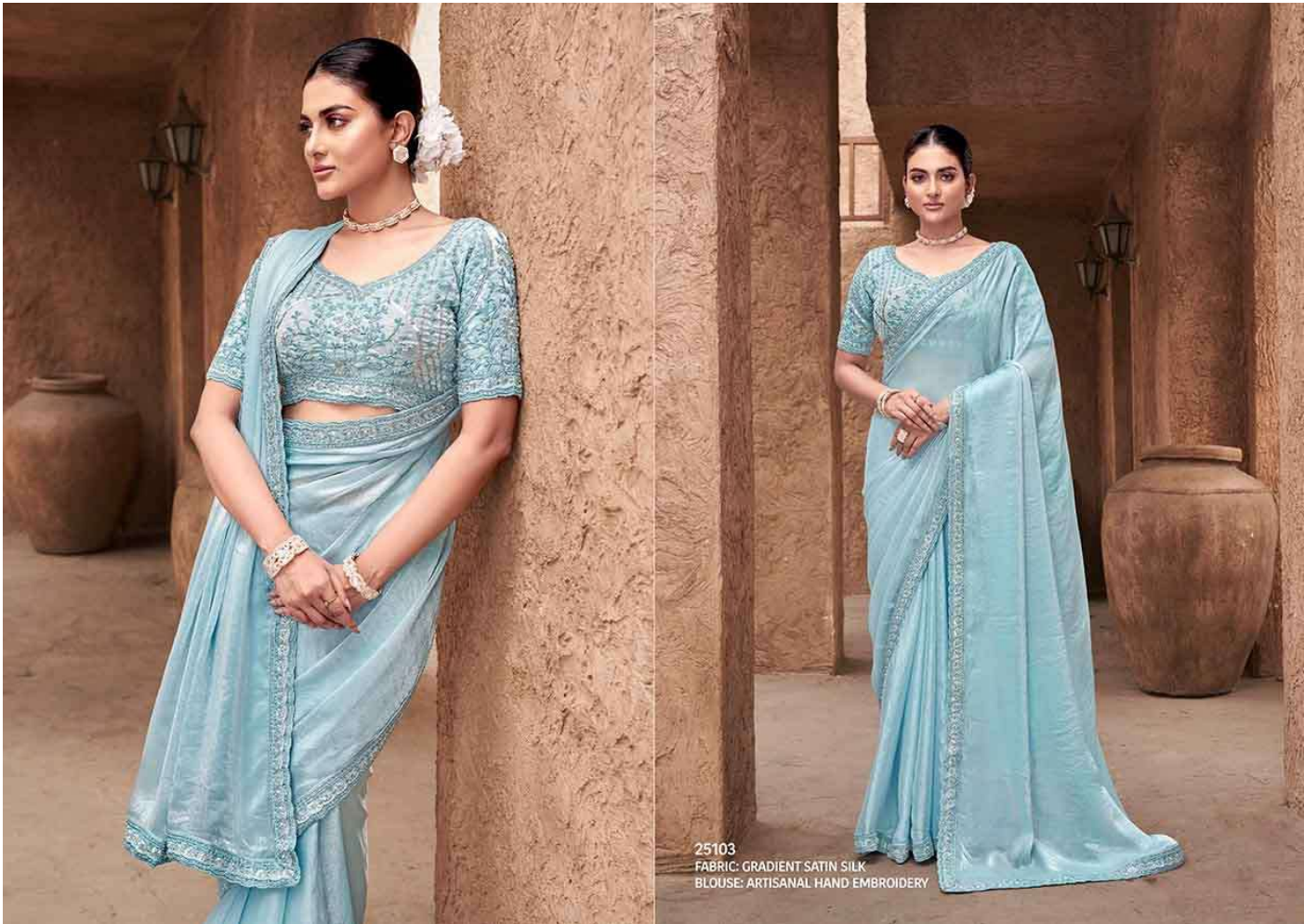
25103 FABRIC: GRADIENT SATIN SILK BLOUSE: ARTISANAL HAND EMBROIDERY