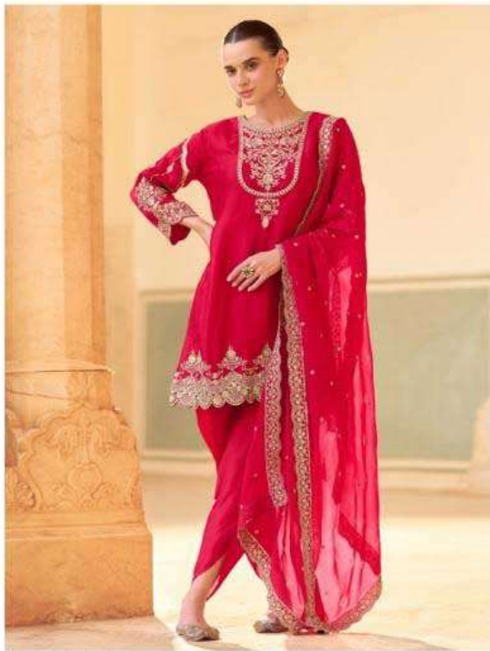
D NO : 5759