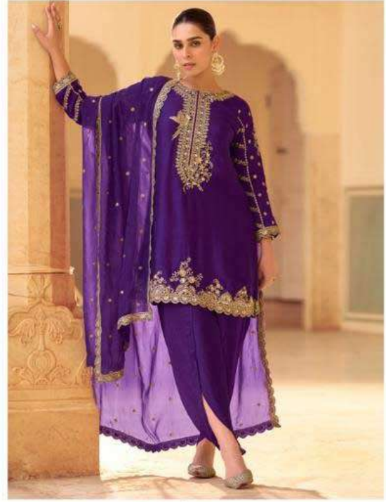
D NO : 5758