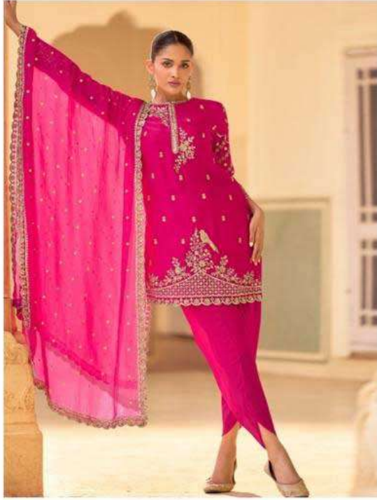
D NO : 5757