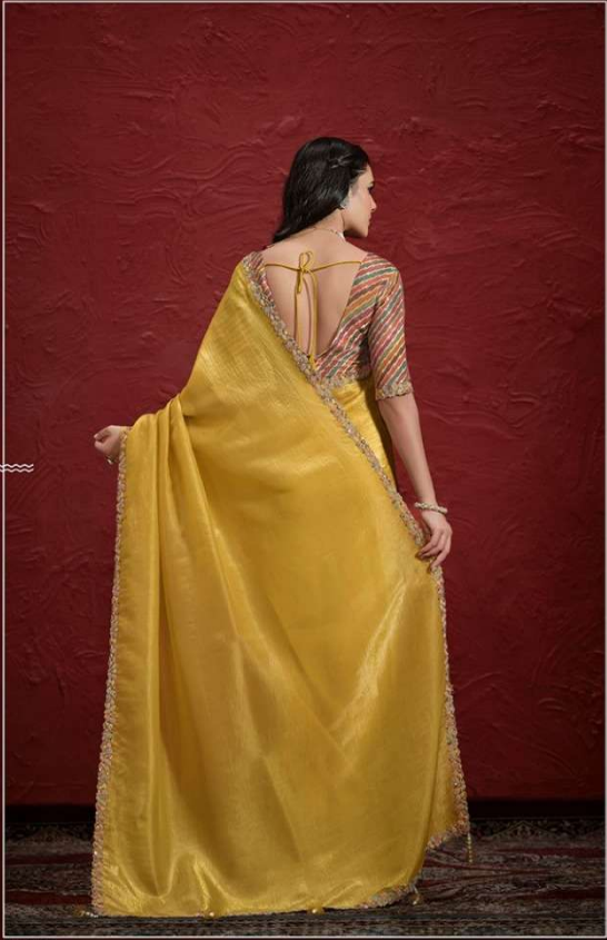
24202 FABRIC : PAPER SILK CRINKLE BLOUSE : RANGKAT EMBROIDERY Ready to wear