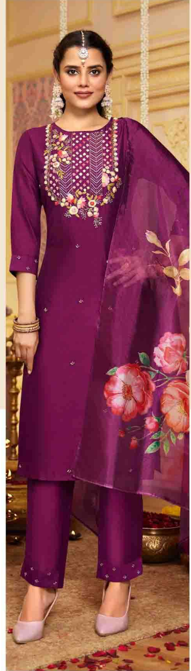
Sangeet VOL-06 3996