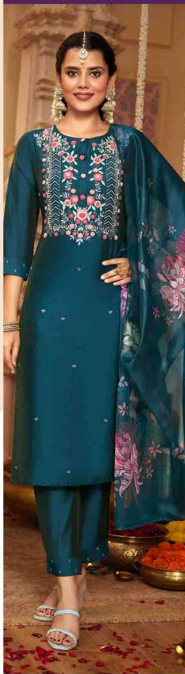
Sangeet VOL-06 3995