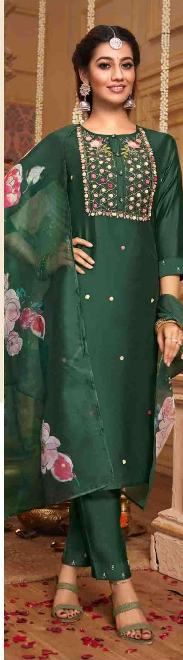
Sangeet VOL-06 3992