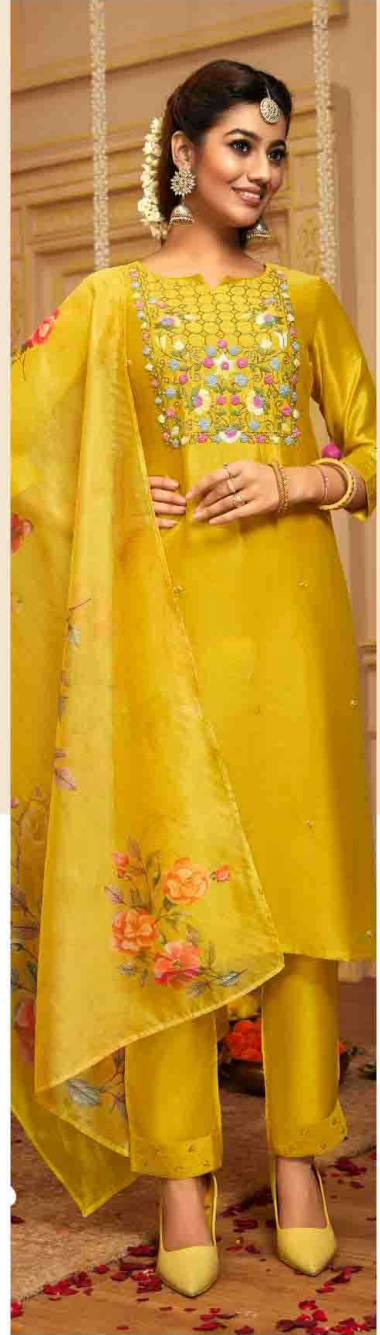
Sangeet VOL-06 3993