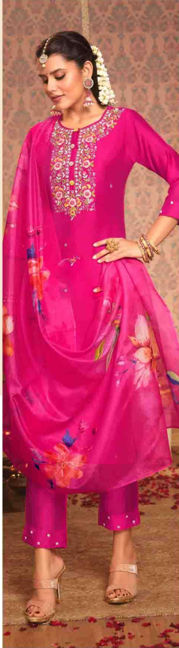
Sangeet VOL-06 3994