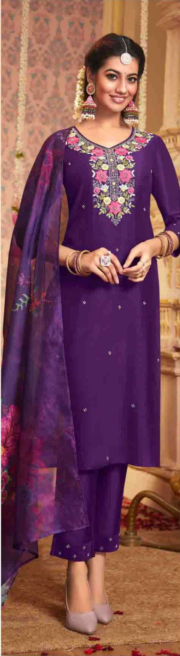
Sangeet VOL-06 3991