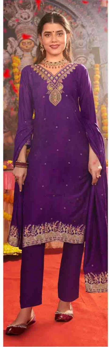
PALKI Vol-04 4046