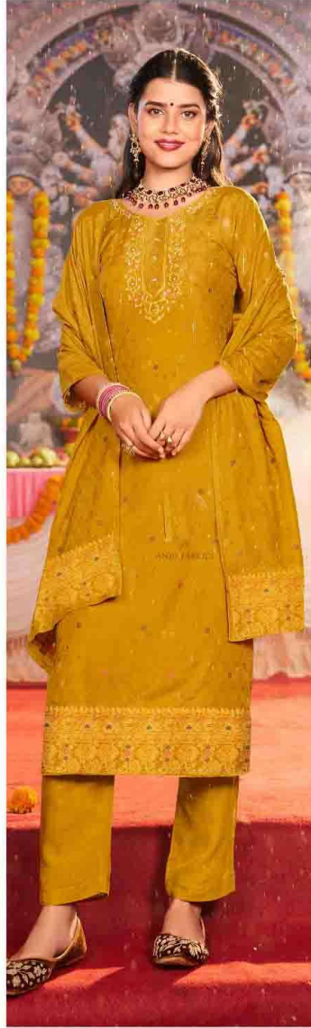
PALKI Vol-04 4042