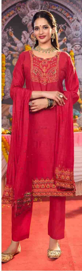
PALKI Vol-04 4045