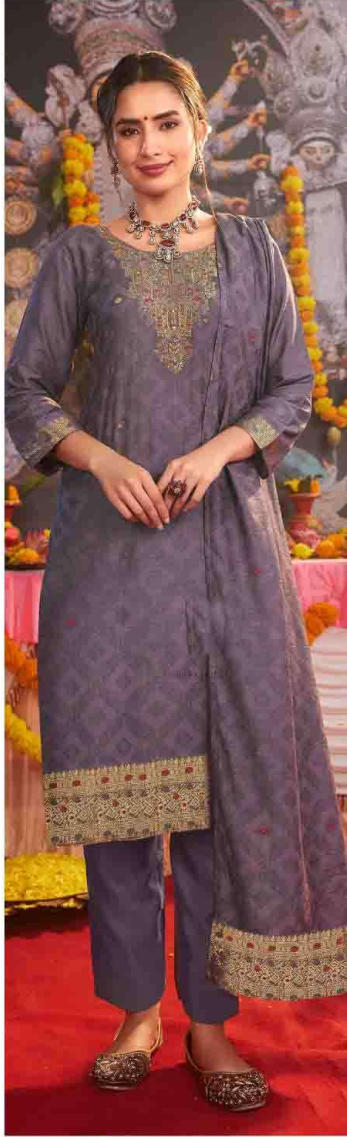
PALKI Vol-04 4044