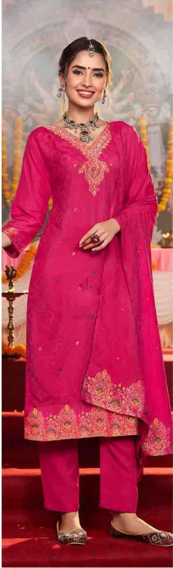
PALKI Vol-04 4041