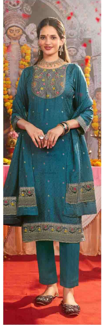
PALKI Vol-04 4043