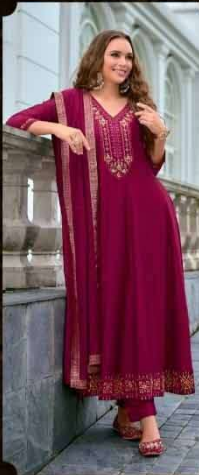
◆ 22801 ◆