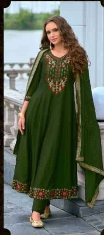
◆ 22804 ◆