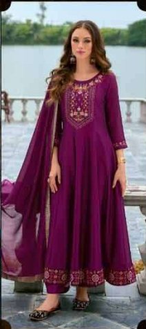
◆ 22803 ◆