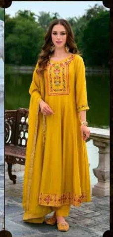
◆ 22806 ◆