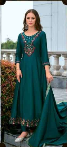
◆ 22802 ◆