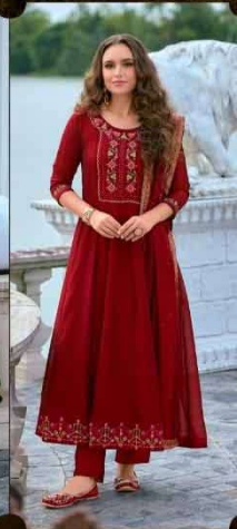
◆ 22805 ◆