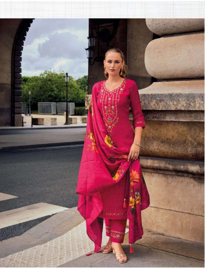
PURE ELEGANCE WITH ALLURING FLORAL PATTERNS ON LACY FABRIC AND ADD GLAMOUR TO YOUR STYLE