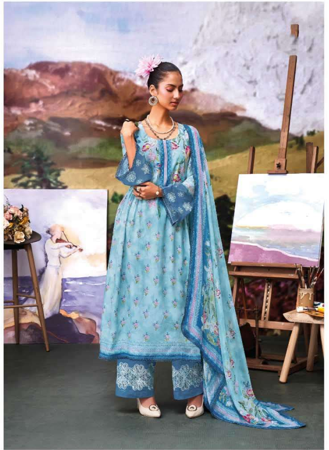
A great photograph is one that fully expresses what one feels, in the deepest sense, about what is being photographed.