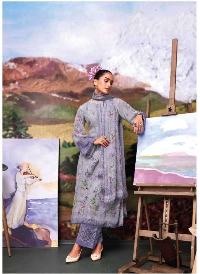
A great photograph is one that fully expresses what our feelings are, shows what is being photographed.