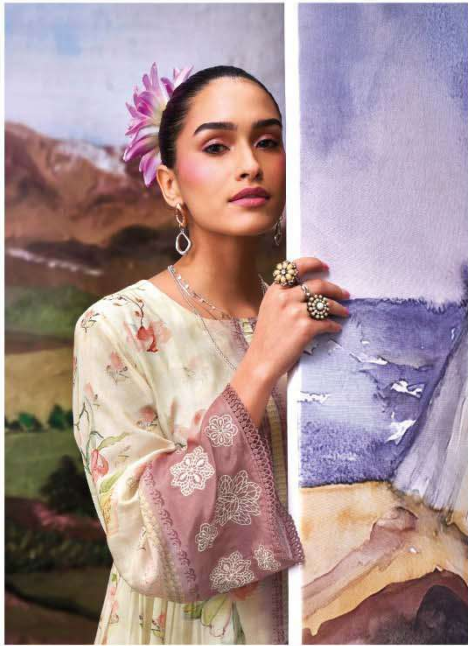
A great photograph is one that fully expresses what one feels, in the deepest sense, about what is being photographed.