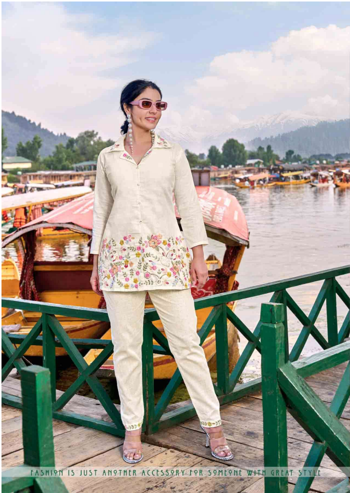
FASHION IS JUST ANOTHER ACCESSORY FOR SOMEONE WITH GREAT STYLE