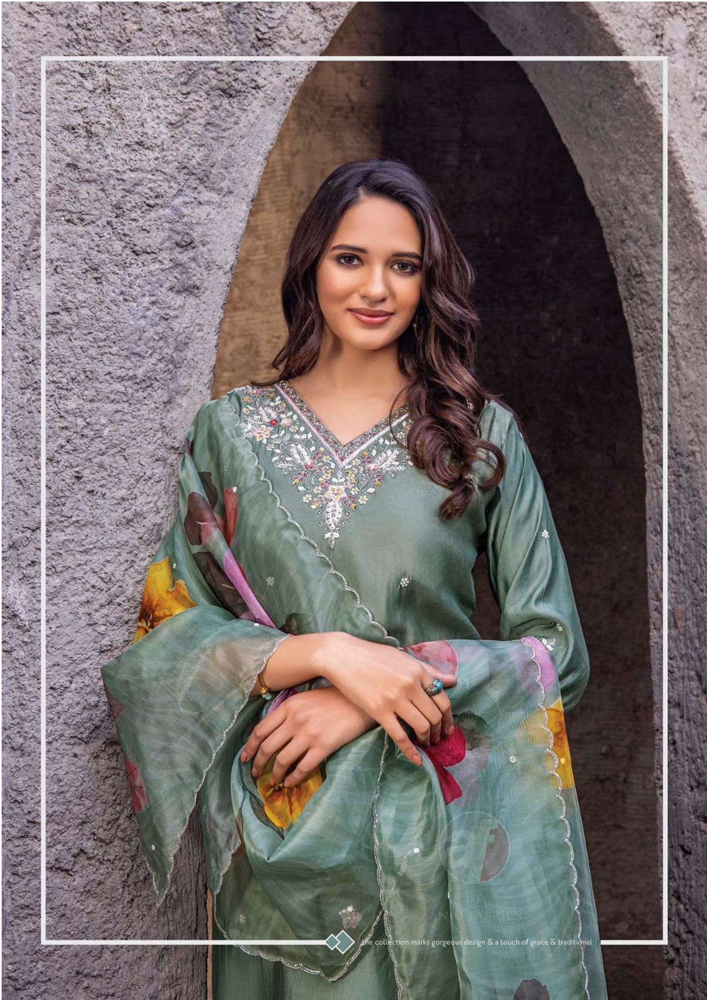
the collection marks gorgeous design & a touch of grace & traditional