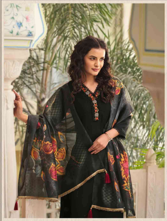
"One is never over-dressed or under-dressed with a Little Black Dress."