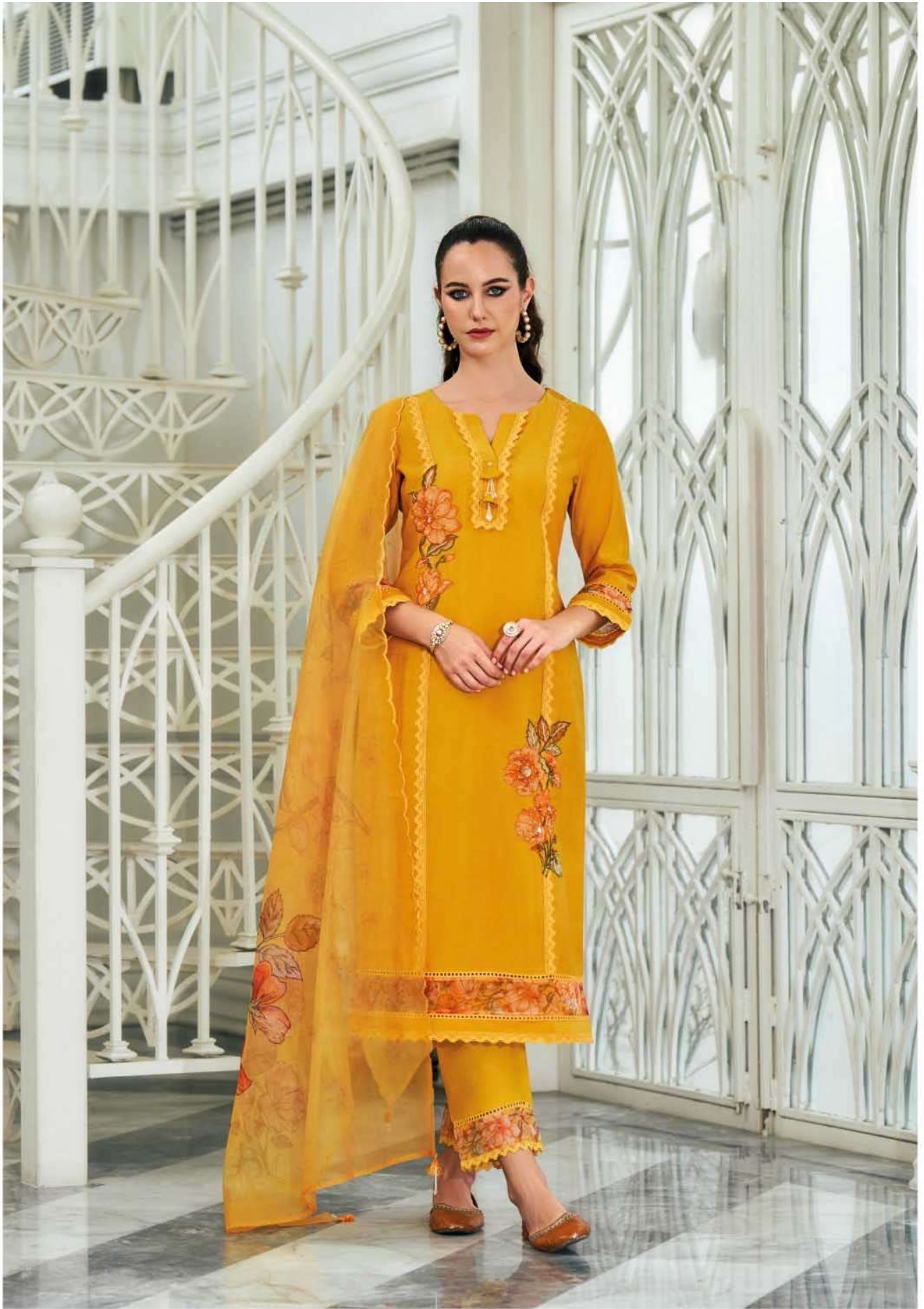
G O L D E N B E A U T Y - 1 1 5 2