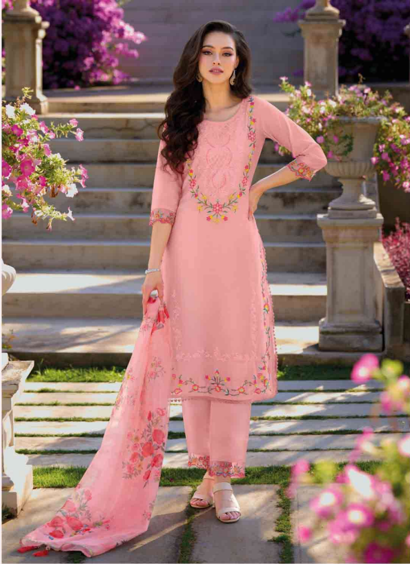
D.NO 16106 Elegance is not standing out, but being remembered