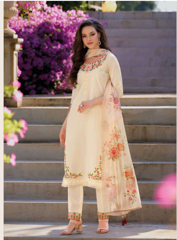
D.NO 16102 Elegance is not standing out, but being remembered