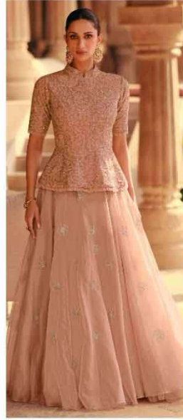
CODE - 5393