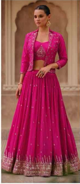
CODE - 5391