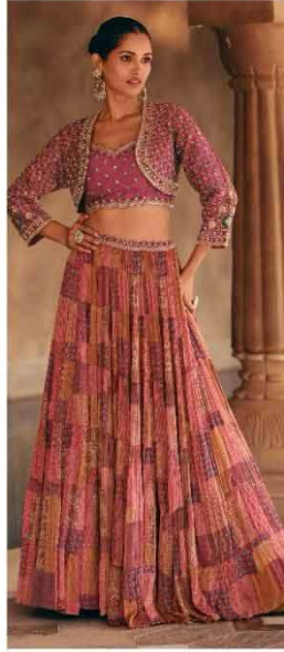
CODE - 5392