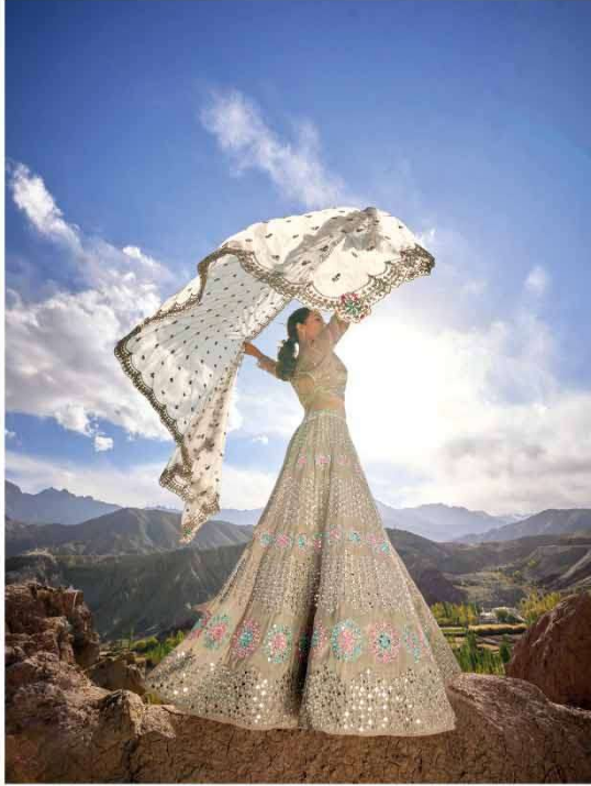
Women who know how secure in their own strength will find clothes.