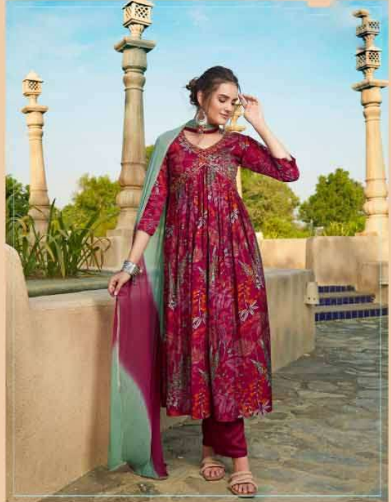
D.No - 1002