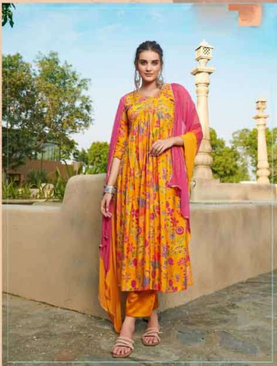
D.No - 1003