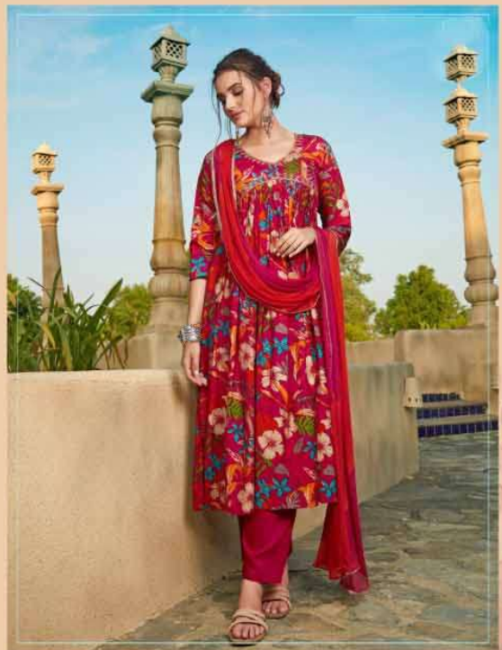
D.No - 1004