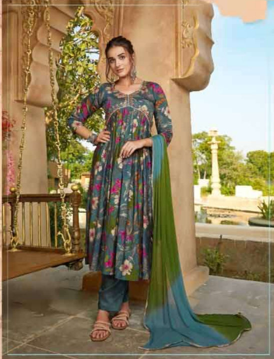
D.No - 1001