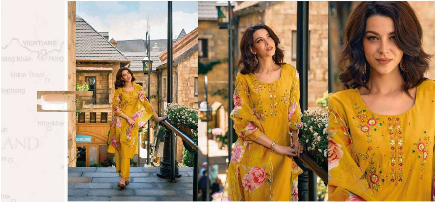
Never be afraid to show your real self through style.