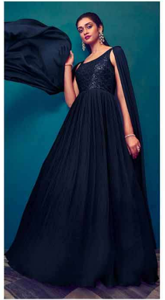
CODE + 4964