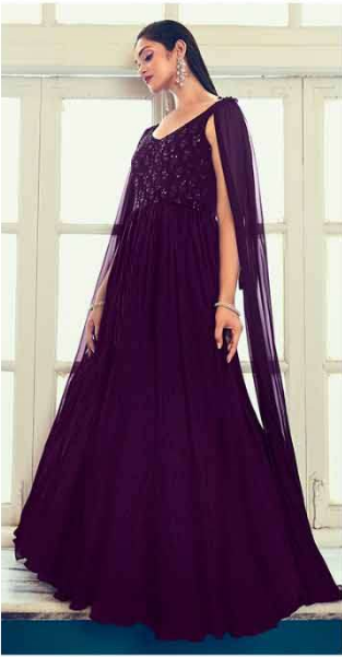
CODE + 4961