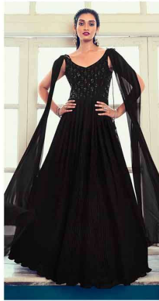
CODE + 4963