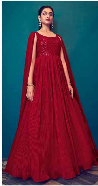
CODE + 4962