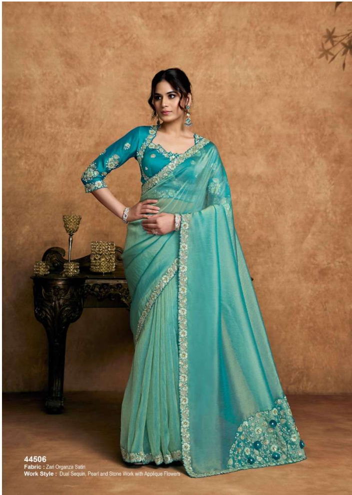
44506 Fabric : Zari Organza Satin Work Style : Dual Sequin, Pearl and Stone Work with Applique Flowers