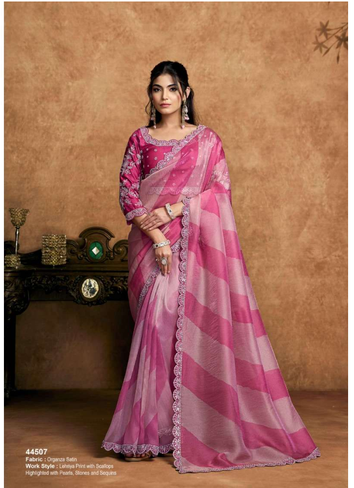
44507 Fabric : Organza Satin Work Style : Lakhya Print with Scallops Highlighted with Pearls, Stones and Sequins