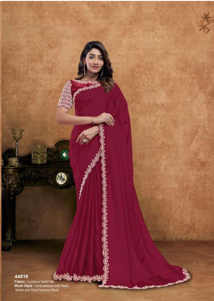
44516 Fabric : Lustrous Satin Silk. Work Style : Embellished with Pearl, Stone and Petal Sequine Work.