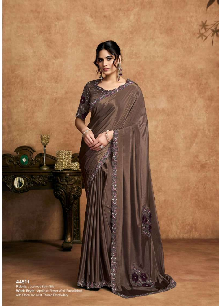
44511 Fabric : Lustrous Satin Silk Work Style : Applique Flower Work Embellished with Stone and Multi Thread Embroidery