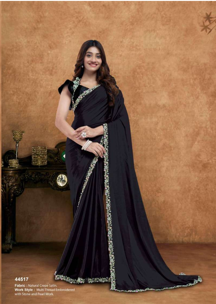
44517 Fabric : Natural Crepe Satin. Work Style : Multi Thread Embroidered with Stone and Pearl Work.