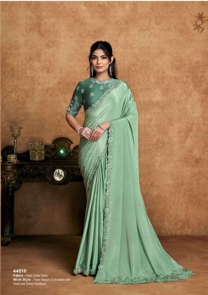
44510 Fabric : Pure Crepe Satin Work Style : Floral Sequin Embroidery with Pearl and Stone Handwork