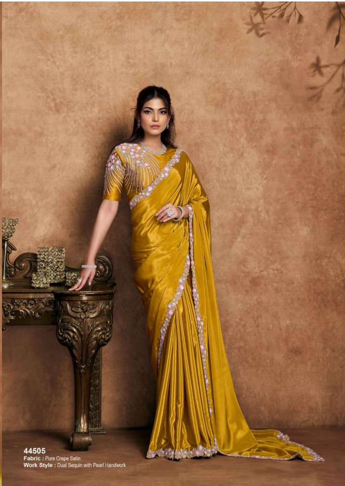
44505 Fabric : Pure Crepe Satin Work Style : Dual Sequin with Pearl Handwork