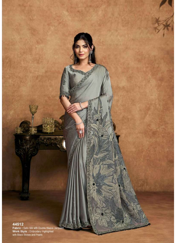
44512 Fabric : Satin Silk with Double Weave Jacquard Work Style : Embroidery Highlighted with Black Stones and Pearls