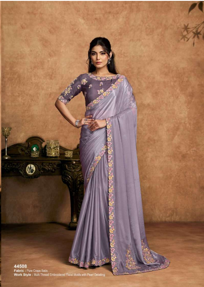
44508 Fabric : Pure Crepe Satin Work Style : Multi Thread Embroidered Floral Motifs with Pearl Detailing