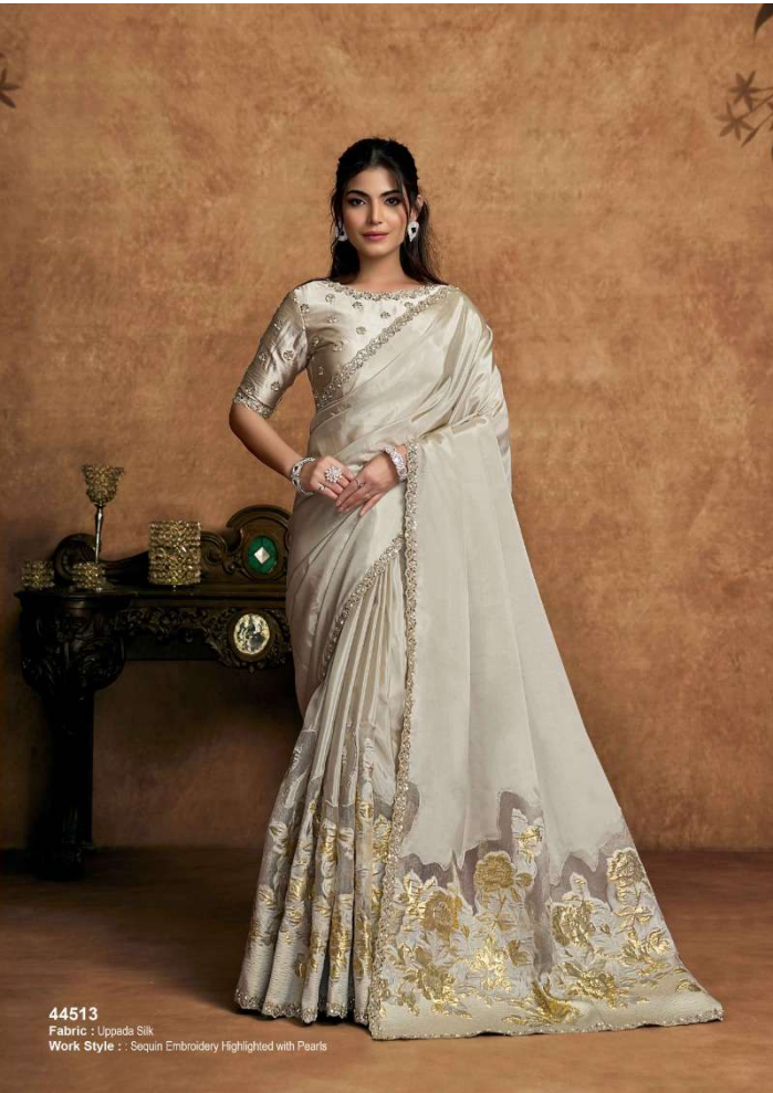
44513 Fabric : Uppada Silk Work Style : Sequin Embroidery Highlighted with Pearls