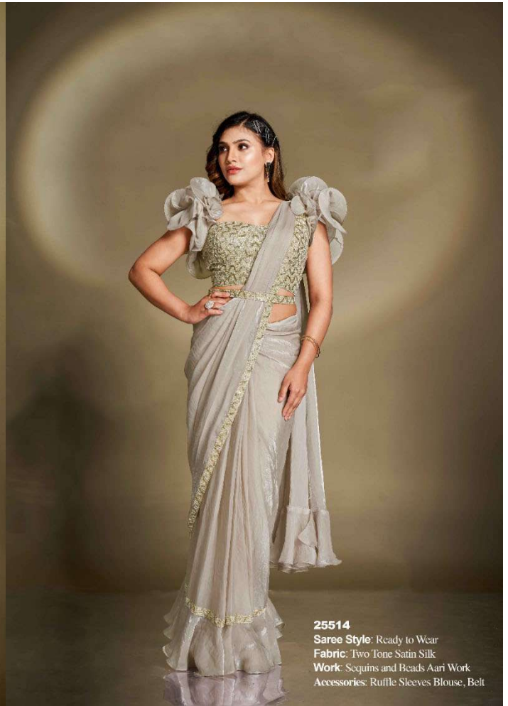
25514 Saree Style: Ready to Wear Fabric: Two Tone Satin Silk Work: Sequins and Beads Aari Work Accessories: Ruffle Sleeves Blouse, Belt