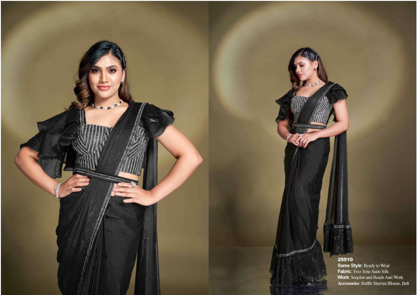
25510 Saree Style: Ready to Wear Fabric: Two Tone Satin Silk Work: Sequins and Beads Aari Work Accessories: Ruffle Sleeves Blouse, Belt