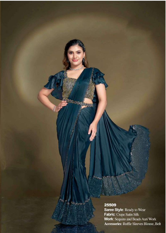
25509 Saree Style: Ready to Wear Fabric: Crepe Satin Silk Work: Sequins and Beads Aari Work Accessories: Ruffle Sleeves Blouse, Belt