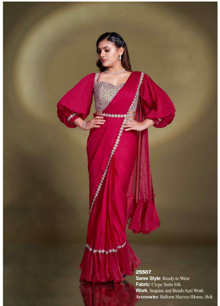
25507 Saree Style: Ready to Wear Fabric: Crepe Satin Silk Work: Sequins and Beads Aari Work Accessories: Balloon Sleeves Blouse, Belt