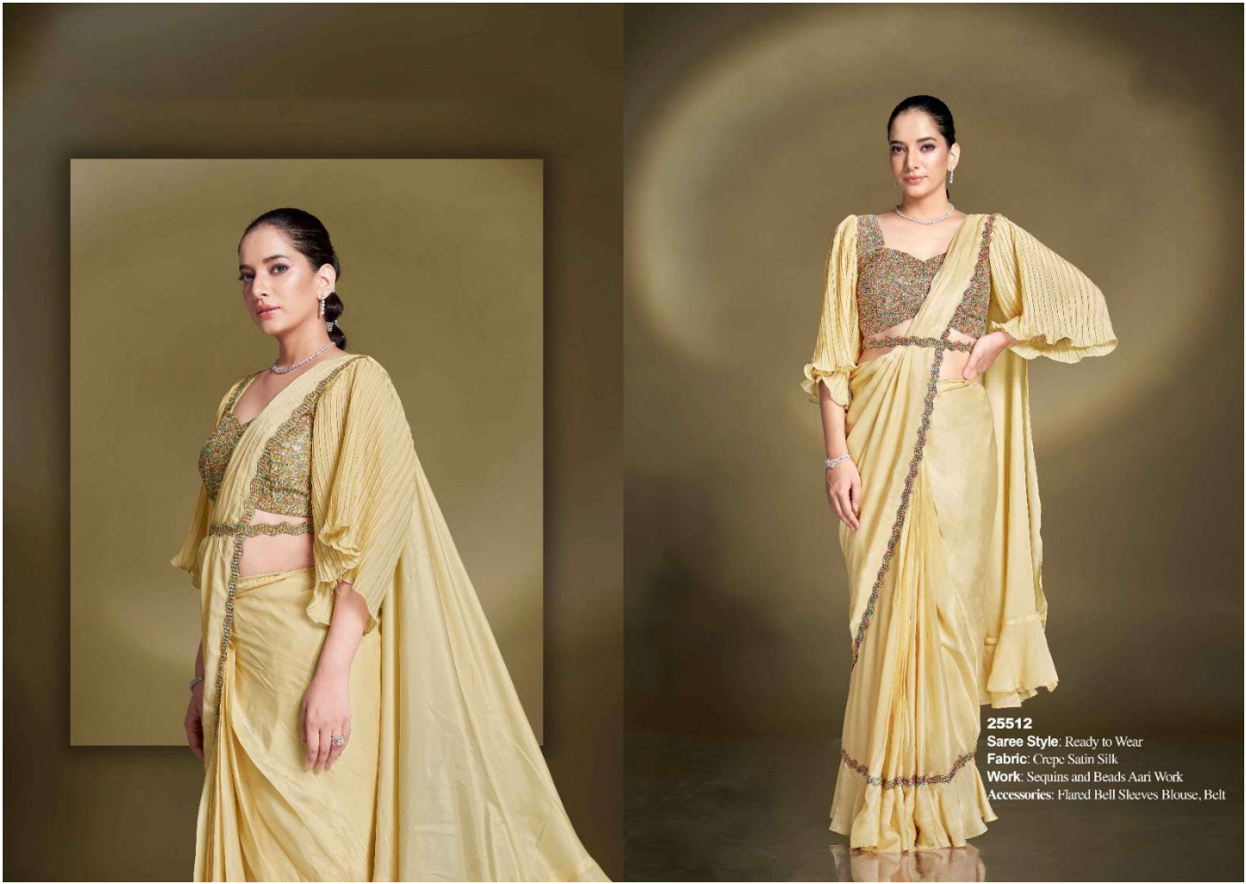
25512 Saree Style: Ready to Wear Fabric: Crepe Satin Silk Work: Sequins and Beads Aari Work Accessories: Flared Bell Sleeves Blouse, Belt