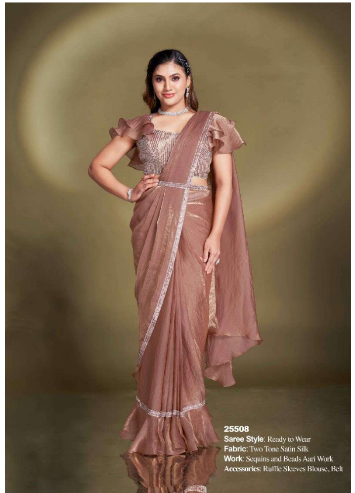
25508 Saree Style: Ready to Wear Fabric: Two Tone Satin Silk Work: Sequins and Beads Aari Work Accessories: Ruffle Sleeves Blouse, Belt