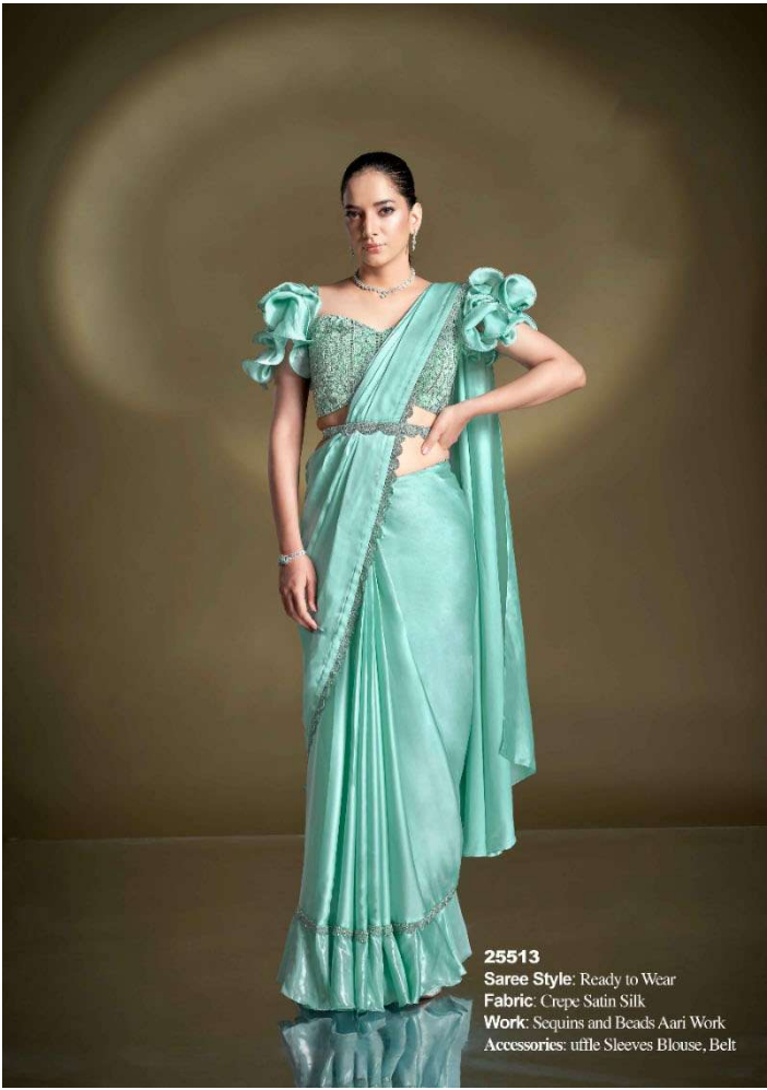
25513 Saree Style: Ready to Wear Fabric: Crepe Satin Silk Work: Sequins and Beads Aari Work Accessories: tulle Sleeves Blouse, Belt