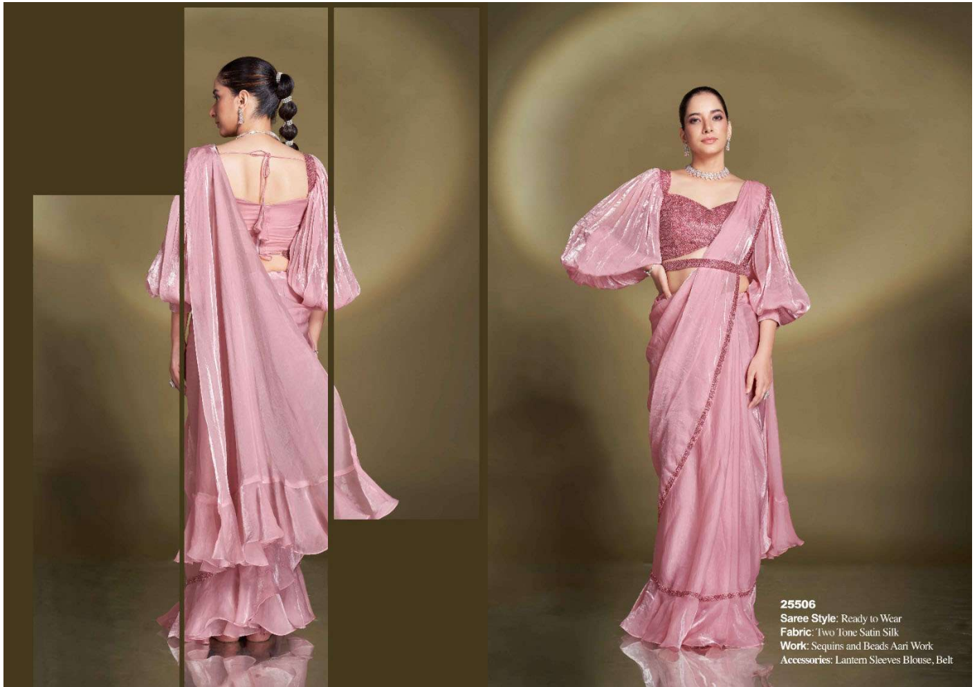
25506 Saree Style: Ready to Wear Fabric: Two Tone Satin Silk Work: Sequins and Beads Aari Work Accessories: Lantern Sleeves Blouse, Belt